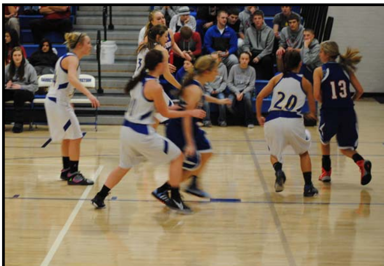
The Lady Blue Dragons play tough defense against the Hills-Beaver Creek Patriots, making it difficult to get into an offensive rhythm.

"We just have to get better at wrestling a whole match. Right now